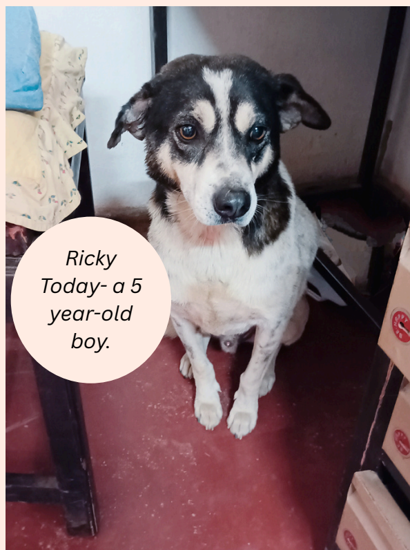
Ricky Today- a 5 year-old boy.