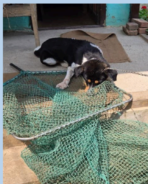
Pic: Suspected rabid dog in custody, being taken to KAS for observation