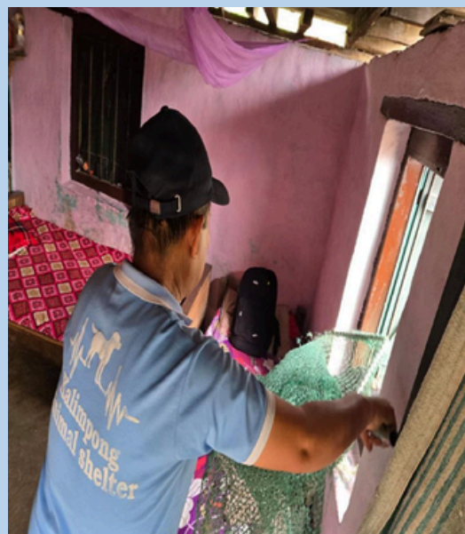
Pic: The Kalimpong Animal Shelter team taking the dog into custody