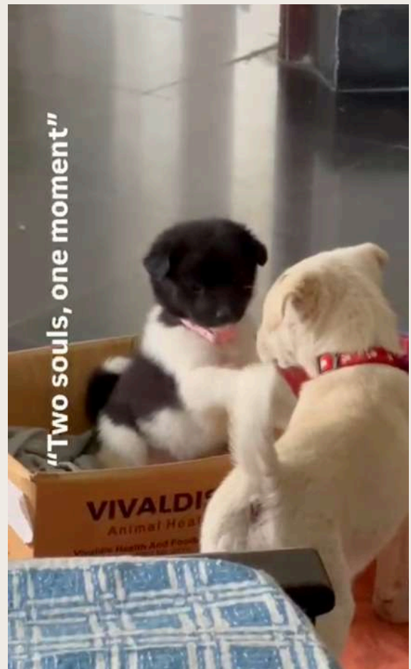
WITH HER NEW FRIEND AT HOME