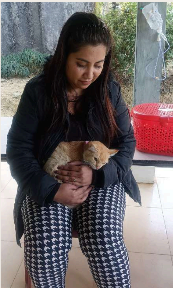
The cat with her owner waiting for the follow-up

January saw a significant influx of cases, with total OPD cases rising to 466. While canine patients made up the majority of our visits, we saw a substantial increase in feline and livestock cases.