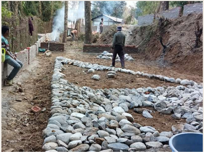
THE ENRICHMENT AREA UNDER CONSTRUCTION