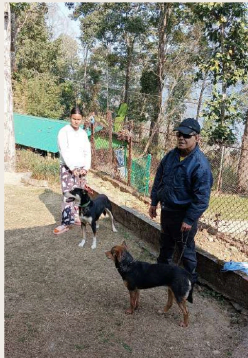
IN-HOUSE STERILISATION PROGRAMME