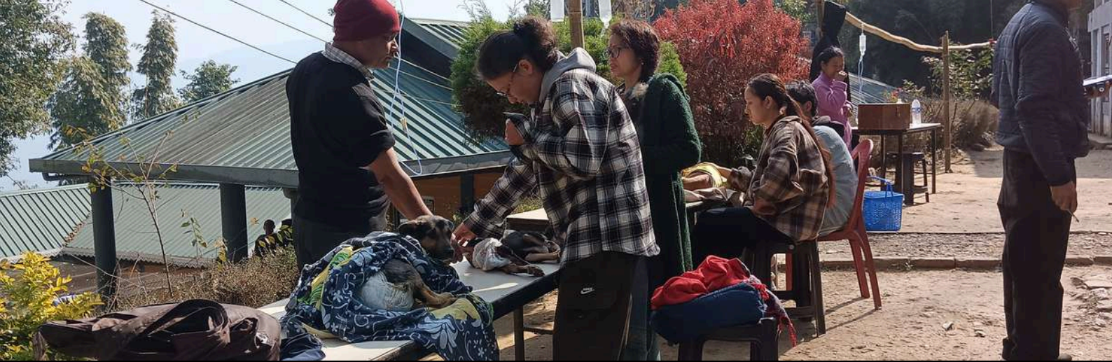
ONGOING TREATMENT AT KALIMPONG ANIMAL SHELTER