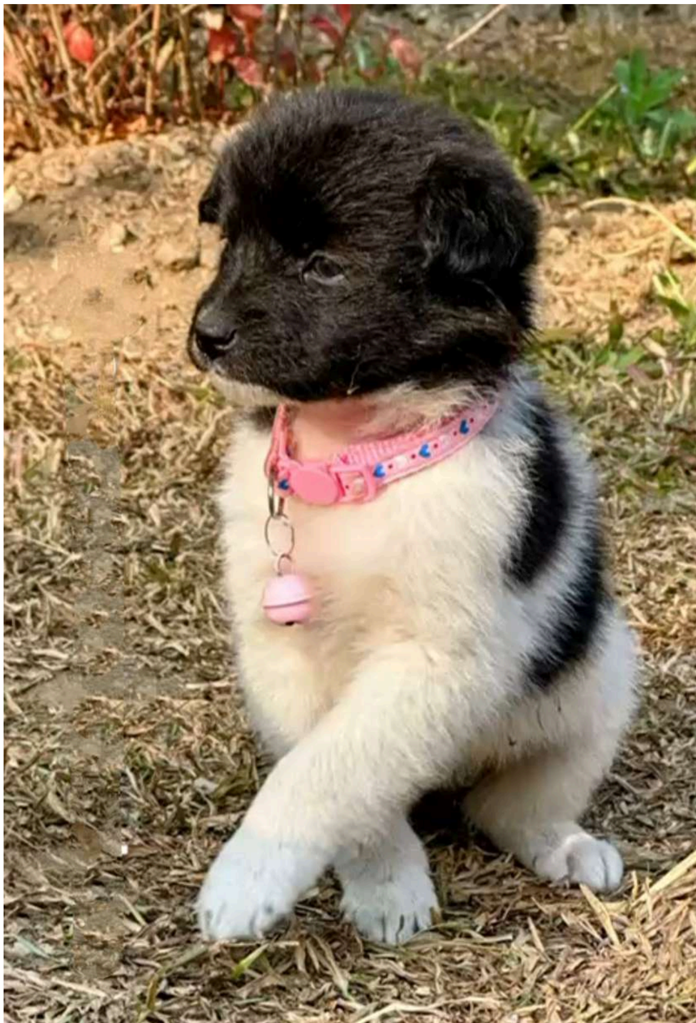
THE ADOPTED LITTLE ONE