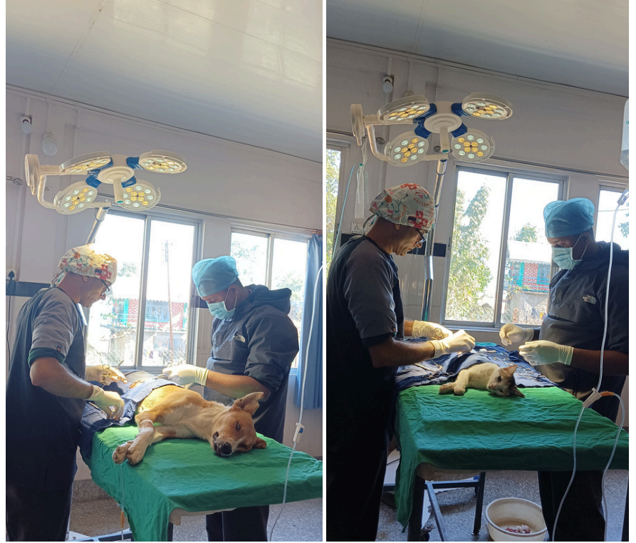
DOG POPULATION MANAGEMEN/ABC (ANIMAL BIRTH CONTROL) SURGERIES IN FULL SWING AT THE DGAS KALIMPONG CENTER

Back at the shelter, we addressed numerous requests and complaints from local communities regarding dog issues. We frequently find that many dogs reported as "ownerless" were actually previously owned and later abandoned. They now live in neighborhoods where no one claims ownership, yet everyone relies heavily on the Shelter for population control. We continue to bridge this gap through humane sterilisation and release.