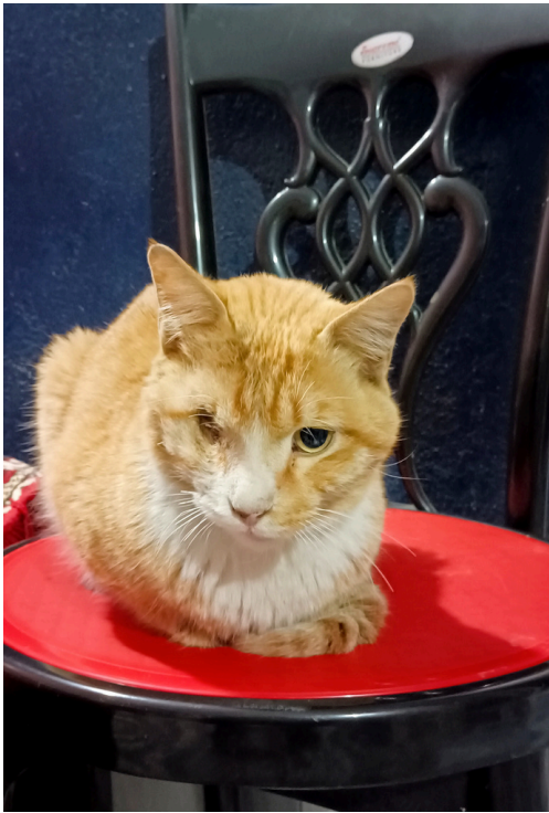
THE OWNER SHARED THE ABOVE PICTURE OF THE CAT AFTER A SUCCESSFUL RECOVERY.

Eventually, he was able to chew and swallow food again, and he has now recovered well. Although he is now living with one eye, he is stable, and his owner has been advised to keep him strictly indoors for his future safety.